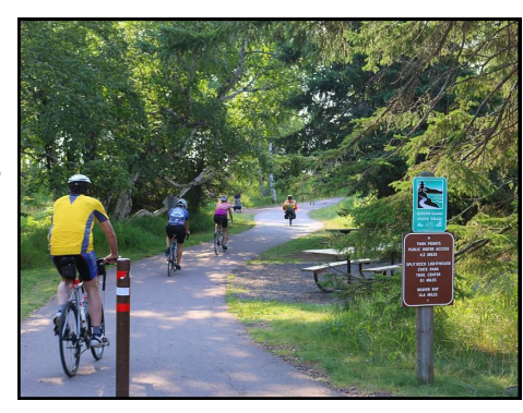
Bikers set out on 28-, 37-, or 55-mile loops on a warm, sun-dappled North Shore day