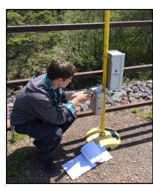
Collecting trail usage data