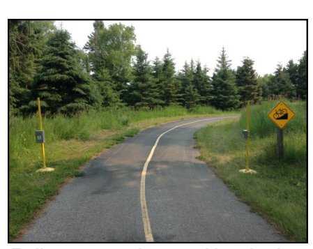
Trail usage counting stanchions in place

The ARDC, in collaboration with the GGTA, MnDOT, the DNR, the Sawtooth Mountain Clinic, and Cook County Moving Matters, completed a trail usage monitoring project this past summer, using sophisticated infrared equipment to count bicycle and pedestrian traffic at various points along the trail. The ARDC is compiling the data collected and preparing a report of findings. The ARDC is also seeking a grant to continue the trail monitoring in 2016. The results will assist trail partners with effective planning and management of the GGST. The report on last summer's results will be posted online this month at www.arrowheadplanning.org/ ggstcount.