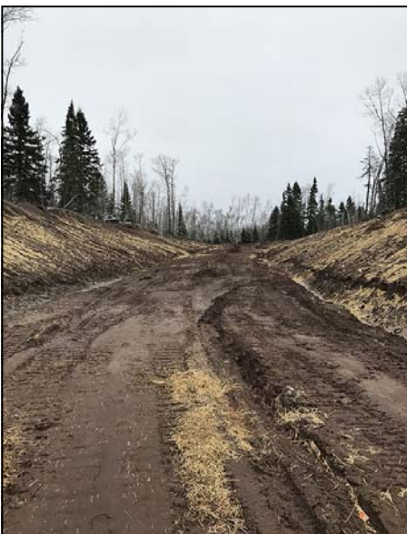
Rebuilt trail section at Temperance River Sate Park - April 2017 photo

We are working with area business owners in the town of Tofte as well as MnDOT, coordinating and planning a trail segment on the NE part of town. After owners within the right of way redesign their parking lots, the DNR plans to engineer a segment of trail extending to the Fisherman's Museum. This could be completed late this season.