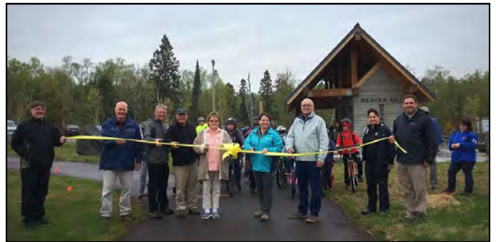
Ribbon-cutting for new Beaver Bay-Silver Bay gap connection trail.