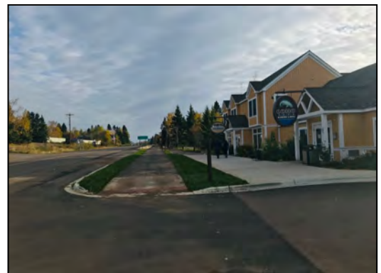
New trail extension in Tofte by Waters Edge Trading Company, Coho Café, and Visitor Center/Fishing Museum.