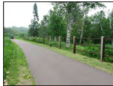
Top: New highway sign at Twin Points. Below: DNR’s new fence post mower.