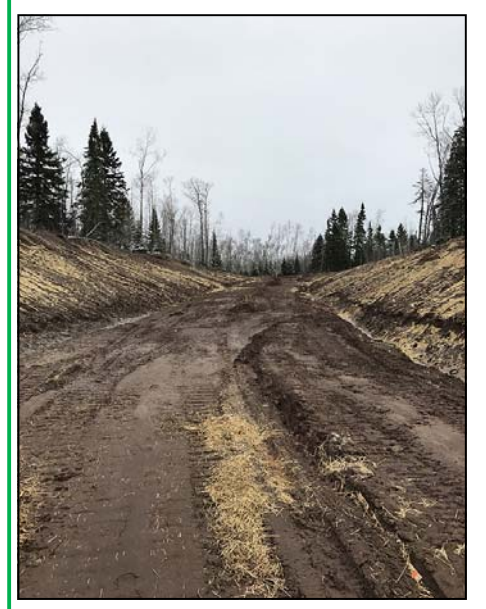
Rebuilt trail section at Temperance River Sate Park - April 2017 photo

We are working with area business owners in the town of Tofte as well as MnDOT, coordinating and planning a trail segment on the NE part of town. After owners within the right of way redesign their parking lots, the DNR plans to engineer a segment of trail extending to the Fisherman's Museum. This could be completed late this season.